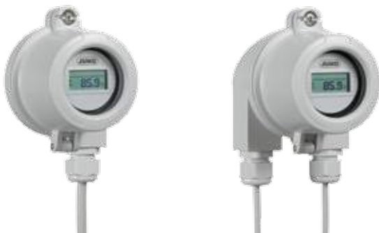
Field housing for probe protection tube mounting