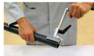
Chamfering the pipe

The pipe must be cut off at right angles. Remove the inside edges and chamfer the outside ones as illustrated in the sketch. Only then is an optimal solvent cemented joint possible.