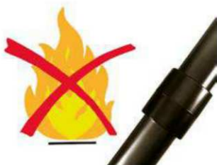
No open flames when cementing. No smoking.