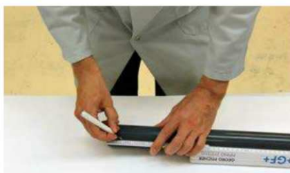
Marking the jointing length

Wipe the outside of the pipe and the inside of the socket with a clean cloth to remove obvious dirt. Marking the jointing length on the pipe end makes it possible to check afterwards whether the pipe has been inserted to the full extent of the socket.