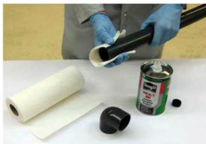
Cleaning the pipe and socket

Important: Pipe end and fitting socket must be dry and free from grease and dirt and must not be touched after cleaning.