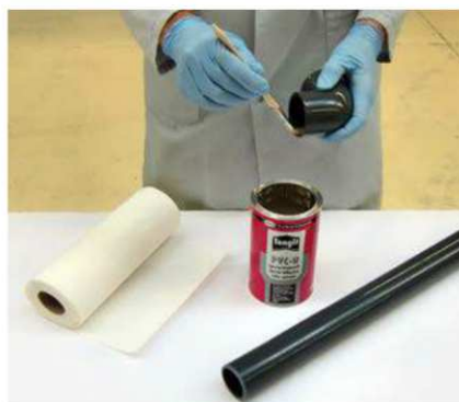
Applying the cement

Remark: When using Tangit Express the opening time is shortened at 20 °C to 1 minute and at 40 °C to 30 seconds. Therefore the maximum dimension is limited to 110 mm .