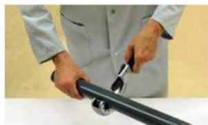
Cutting the pipe to length