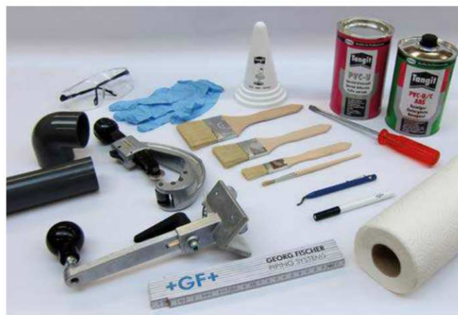
Solvent cementing equipment