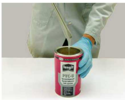
Checking the cement

Note: If the outside diameter of the pipe and the inside diameter of the socket are at opposite extremes of their tolerances, then the pipe cannot be inserted dry into the fitting socket. This will only become possible once the cement has been applied.