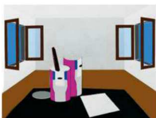
Adequate ventilation of the workplace

Always obey the safety regulations issued by the authorities responsible.